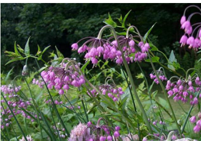
Allium cernuum Nodding Onion upright perennial

This is a partial list of plants for this city. Please contact Hydrotech @ 800-361-8924 for the complete list.