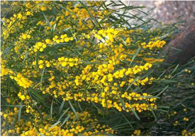
Acacia redolens Prostrate Acacia spreading perennial