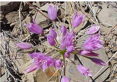
Allium acuminatum Tapertip Onion upright perennial