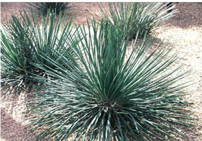
Agave geminiflora Twin Flowered Agave accent succulent