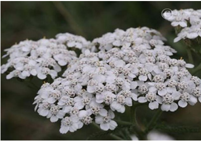
Achillea millefolium Common Yarrow upright perennial