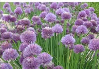
Allium schoenoprasum Chives upright perennial

Foliage Color: Green Bloom Color: Lavender