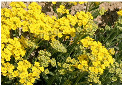
Alyssum montanum Mountain Gold spreading perennial

Foliage Color: Green Bloom Color: Lavender