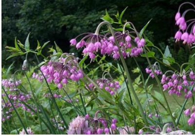
Allium cernuum Nodding Onion upright perennial