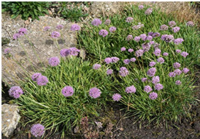
Allium senescens Ornamental Onion upright perennial