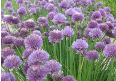
Allium schoenoprasum Chives upright perennial