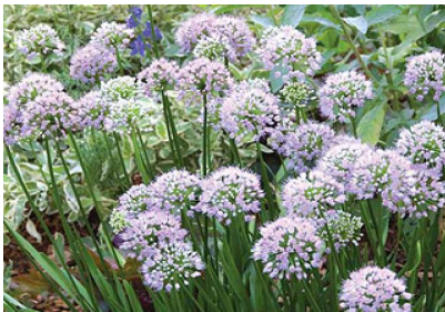
Allium senescens 'Glaucum' White Ornamental Onion upright perennial

Water Needs: Foliage Color: Blue-Green Sun Exposure: Bloom Color: Lavender USDA Hardiness Zones: 2-7